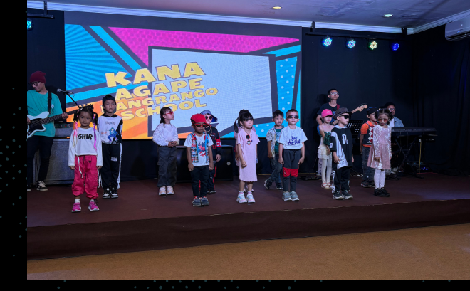
Pangrango Church - Indonesia