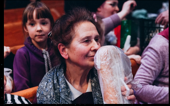
Humanitarian aid + support for Ukraine.

Short term mission trips to Guatemala, Peru & Jamaica