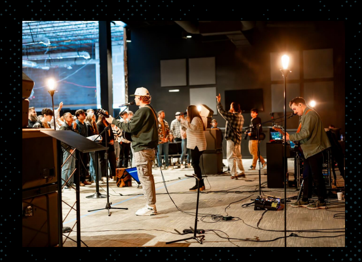
The Well - Tennessee