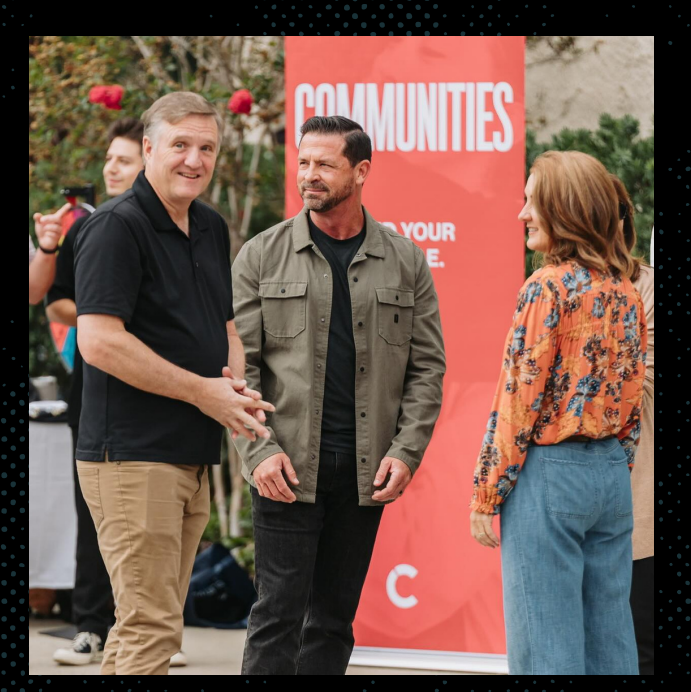
The launch of Captivate's 2nd campus in La Jolla, CA