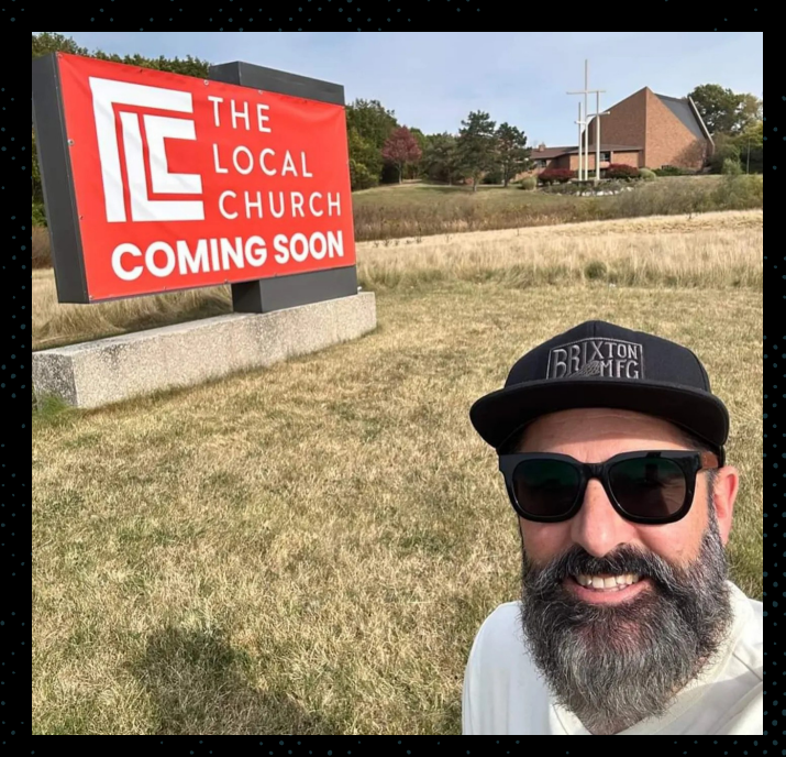
Secured a larger facility for The Local Church in Grand Rapids