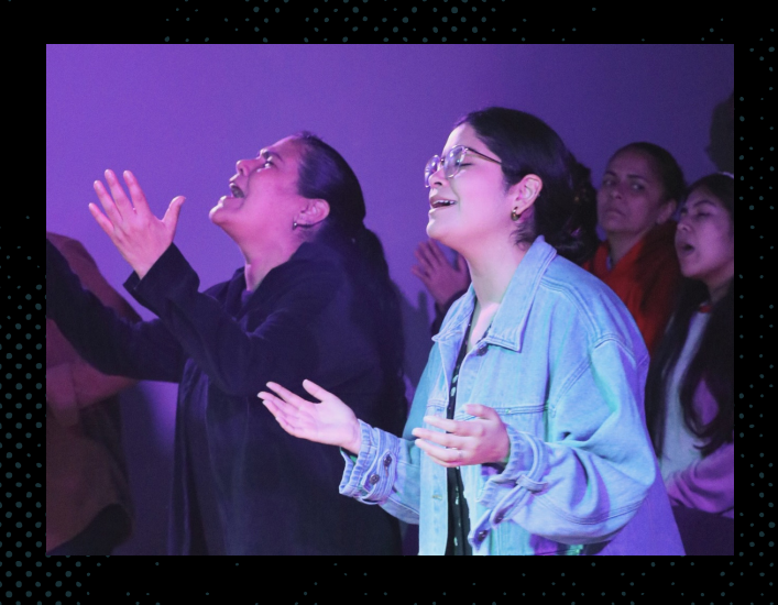
La Iglesia Ciudad - Peru