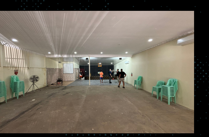
Hope + Life Church - Cambodia